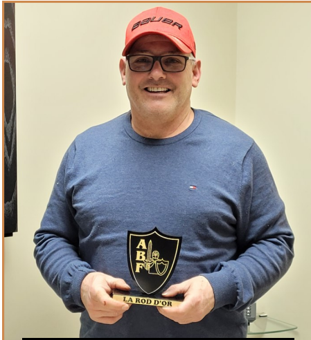
Donald Cadran Worksites

Here are the official photos of the 2021 Golden Rod winners! Congratulations to all of you!