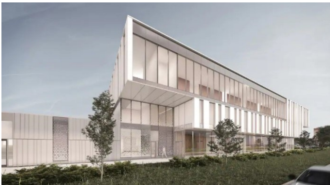
Police station and justice, Levis 700 MT