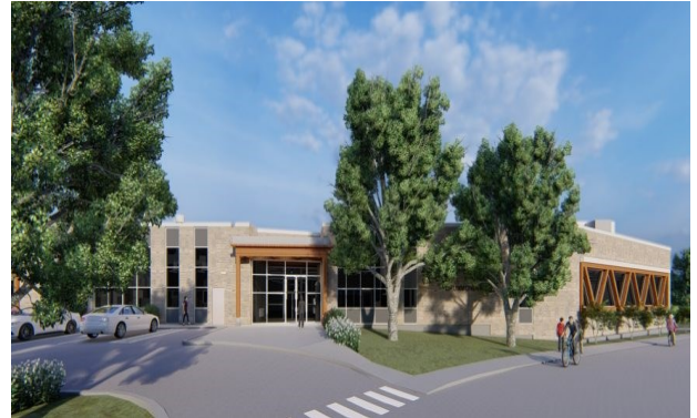
Drinking water plant, Drummondville 1200 MT