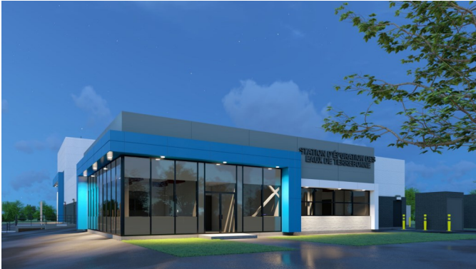
New wastewater treatment plant, Terrebonne—1400 MT