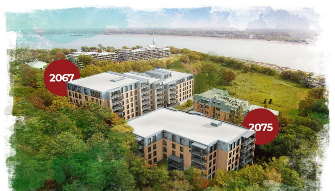
Benmore sur le Parc, Quebec 900 MT