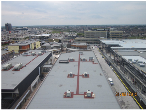
Overview of the Project

It is with pride that we announce that this project is finally completed. Here is a short description and a few photos of this major accomplishment.